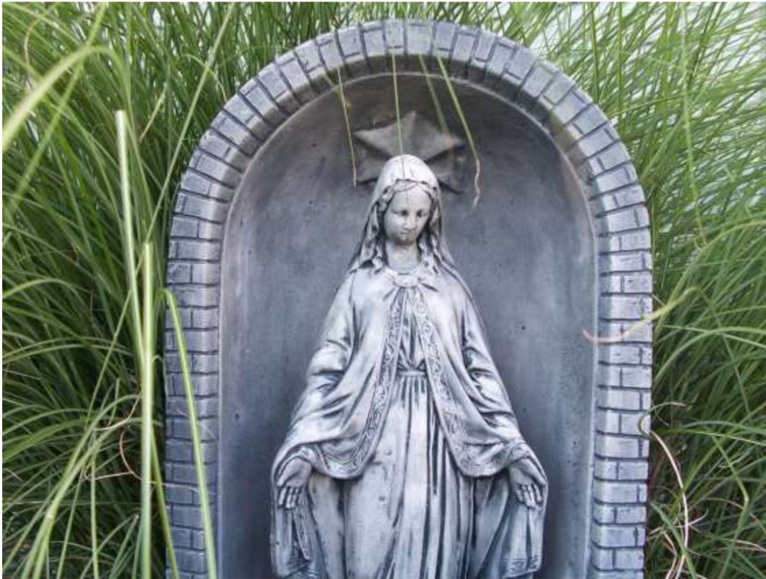
Our Lady Star of the Sea